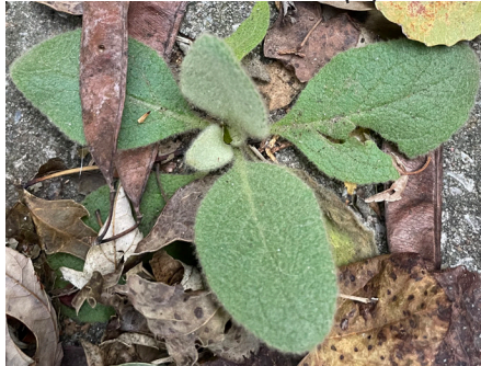
common mullein (b)