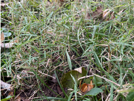
burmuda grass (p)