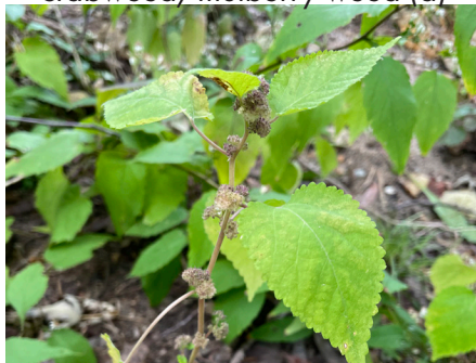
crabweed/mulberry weed (a)