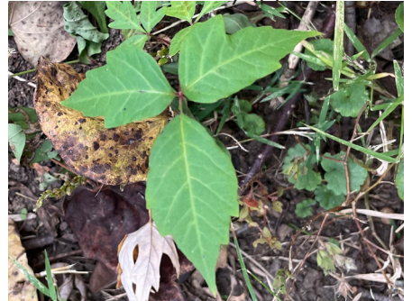
poison ivy (p)